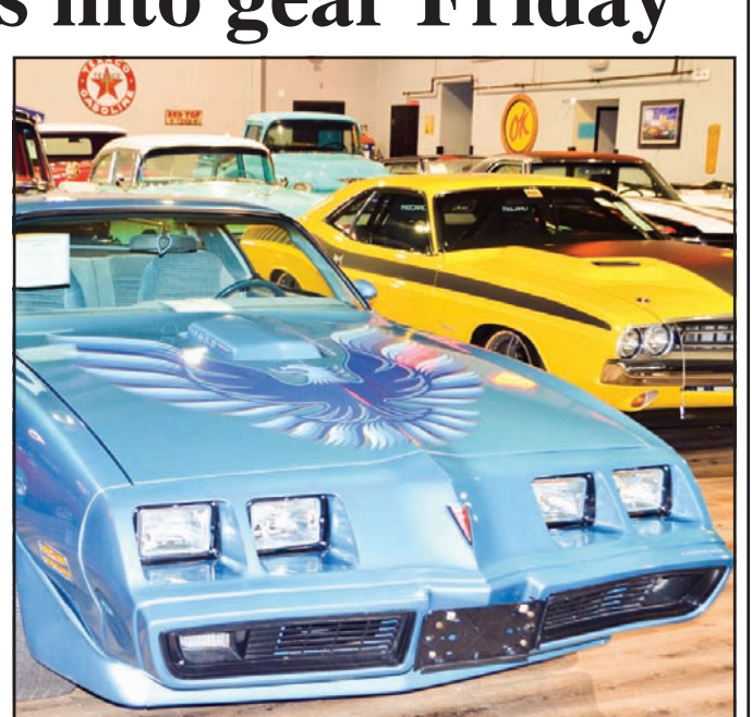
The Memory Lane Classic Car Auction & Car Show promises to be a weekend full of family fun at the Old EMC Headquarters in Young Harris.