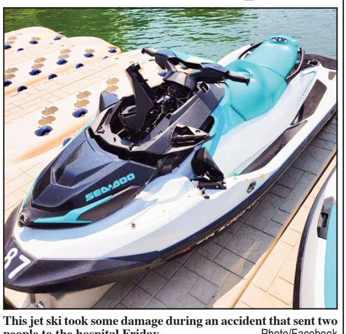
people to the hospital Friday.

Though the exact circumstances surrounding the crash were not available at press time, the Towns County . Herald did learn that one jet ski carrying two males collided See Accident, Page 6A